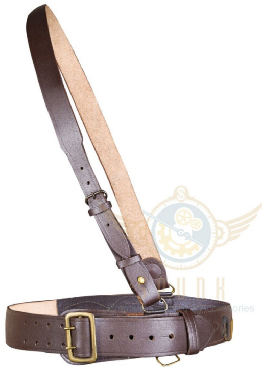
SAM BROWNE BELT