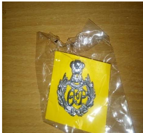
ODISHA POLICE MONOGRAM (Cap Badge)