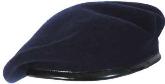
NAVY BLUE BERET CAP