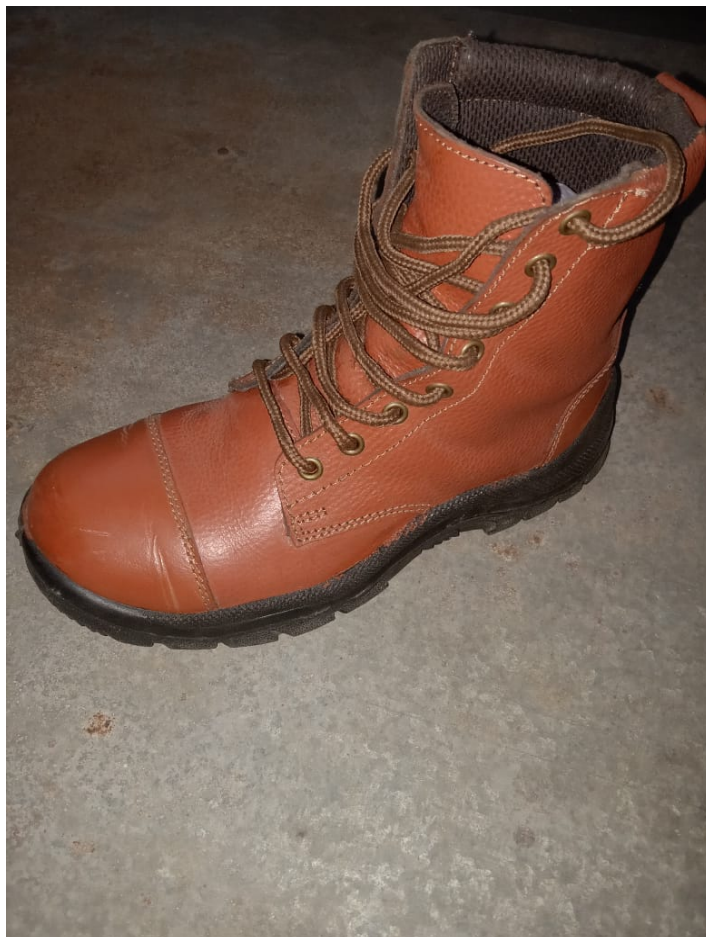
BROWN BOOT OFFICER (DMS)