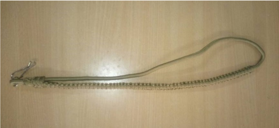
KHAKI LANYARD BRAIDED