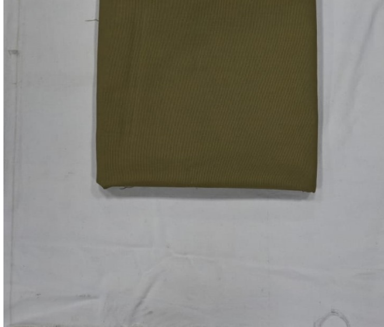
KHAKI TERRY-COTTON (T/C) CLOTH (The shade of the cloth shall match this)