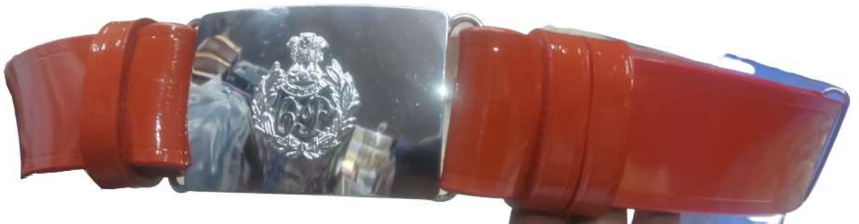
BROWN LEATHER BELT WITH BELT PLATE