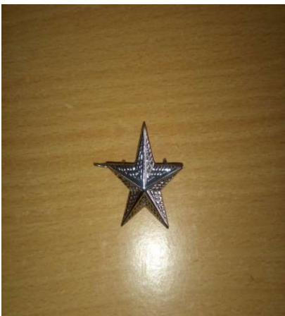
FIVE POINTED STAR