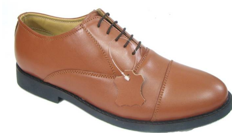
OXFORD SHOES BROWN