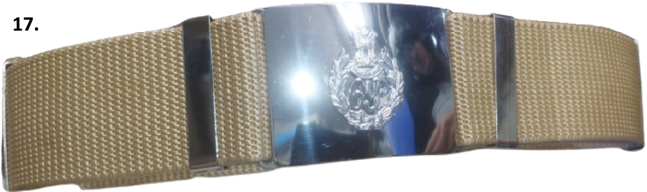
KHAKI NYLON BELT WITH BELT PLATE