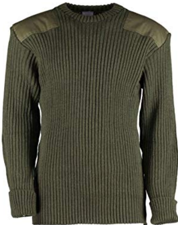
DARK GREEN WOOLEN JERSEY