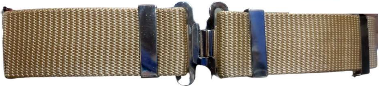
KHAKI NYLON BELT WITH BUCKLE