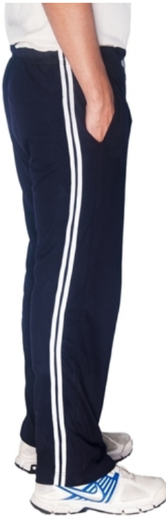
NAVY BLUE TRACK PANT